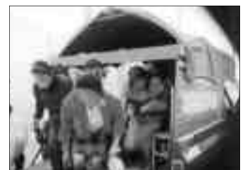
Heading to work in El Salvador

Location: San Marcos Free Trade Zone, El Salvador