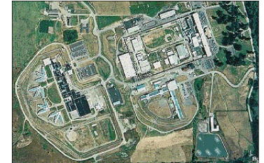
A bird's eye view of the Washington State Reformatory