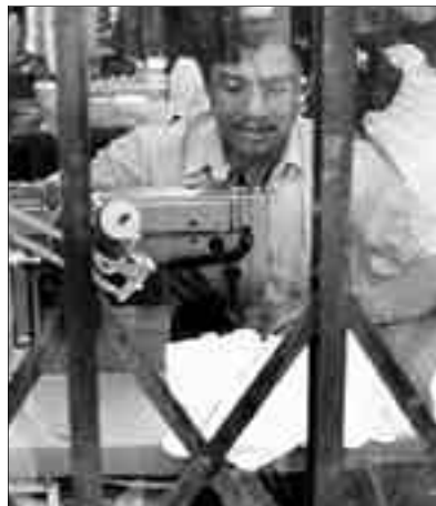
Unregistered garment shop in Los Angeles.

According to a 1997 lawsuit, J. Crew, despite relying on numerous garment shops in California for production of its apparel, was not a registered apparel manufacturer in the state, allowing it to avoid responsibility for labor conditions under California's labor code and anti-sweatshop legislation. Sweatshop Watch, UNITE and the Asia Law Caucus filed suit against J. Crew for using its status as an unregistered manufacturer to duck responsibility for conditions in Los Angeles sweatshops. 15 The U.S. Department of Labor has found that 61 percent of Los Angeles garment shops violate wage and hour regulations, and 96 percent violate health and safety regulations. 16