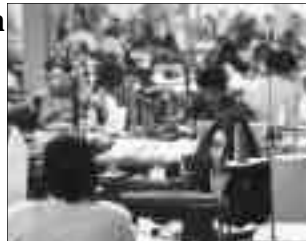
An overcrowded garment shop

Location: Cavite Export Processing Zone, Philippines