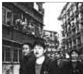
Heading to work in China

In a rare look at conditions in Chinese garment factories, a 1998 National Labor Committee report found three hundred young female workers making suits and jackets for Ann Taylor at this factory in southeastern China. They worked 14-hour shifts, 6 days a week and up to 96 hours per week during rush periods. Their average earnings were 23 cents per hour, though some workers earned as little as 14 cents per hour, far less than is needed to survive in China. The women lived in dormitories with 6 to 10 workers in each room. 2